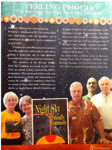
A page from our regional telephone directory highlighting Borrego's dark skies and our Dark Sky Coalition.

represented. Local businesses having received the Dark Sky Friendly Business certificate often use the Coalition logo in their advertising.