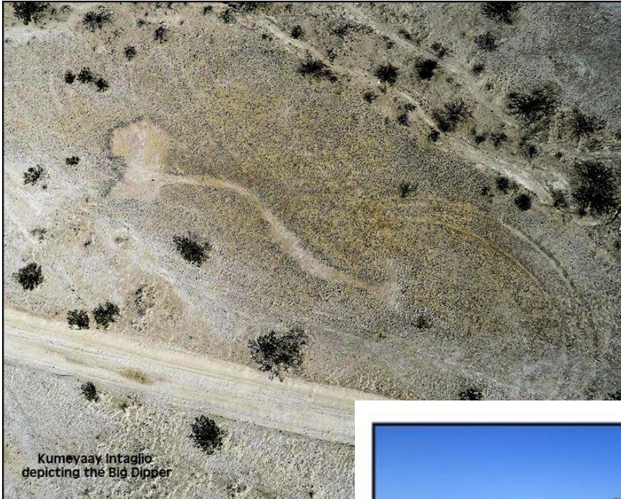
Kumeyaay Intaglio depicting the Big Dipper

in the 1970s and include celestial-related features.