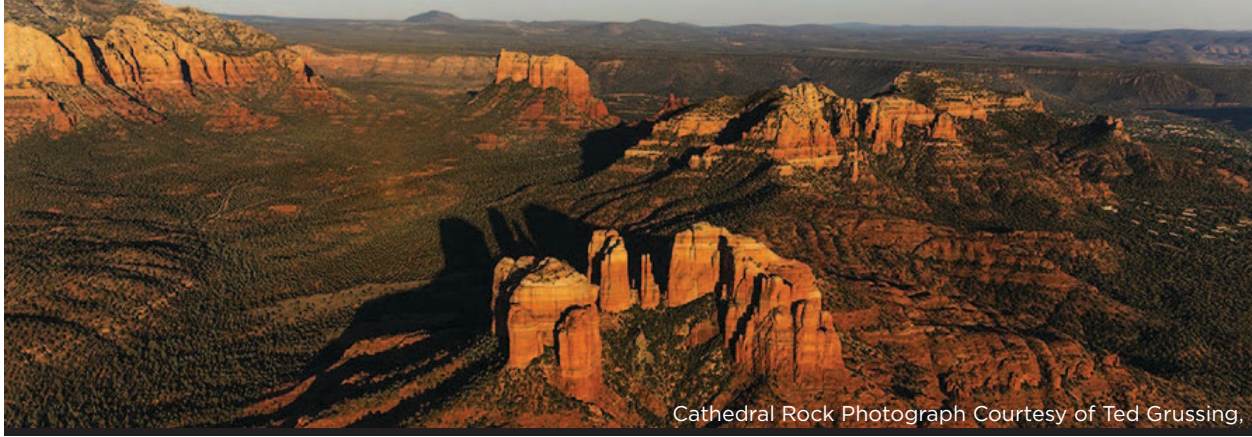
Cathedral Rock

The Keep Sedona Beautiful (KSB) Dark-Sky Committee is pleased to report progress in 2015 towards its goals of bringing more community awareness of light pollution and preserving our magnificent natural resource... our dark night sky. This was accomplished through the committee's dark-sky outreach program, which included educational events and support of Dark-Sky Community designations for Big Park/Village of Oak Creek and Red Rock State Park (RRSP)