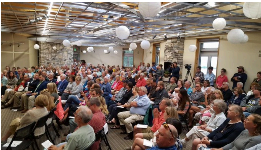
Grand Opening of the Waterfront Event Center and Observatory at the Headlands International Dark Sky Park, June 2017. Over 300 community members joined us!

Though many will remember 2017 as the year of the Great American Total Solar Eclipse, here in northwest lower Michigan, it will be fondly remembered as the year we opened Waterfront Event Center and Observatory, just after we won the prestigious Governor's State Tourism Campaign Pure Michigan Award for innovative and exemplary best practices in natural, cultural and heritage stewardship in our daily operations.