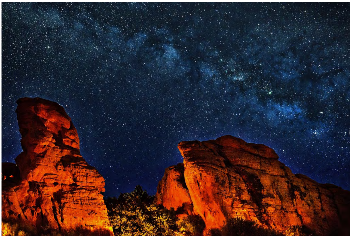
Figure 1. Red Pockets Sandstone features located in Grand Canyon-Parashant National Monument.