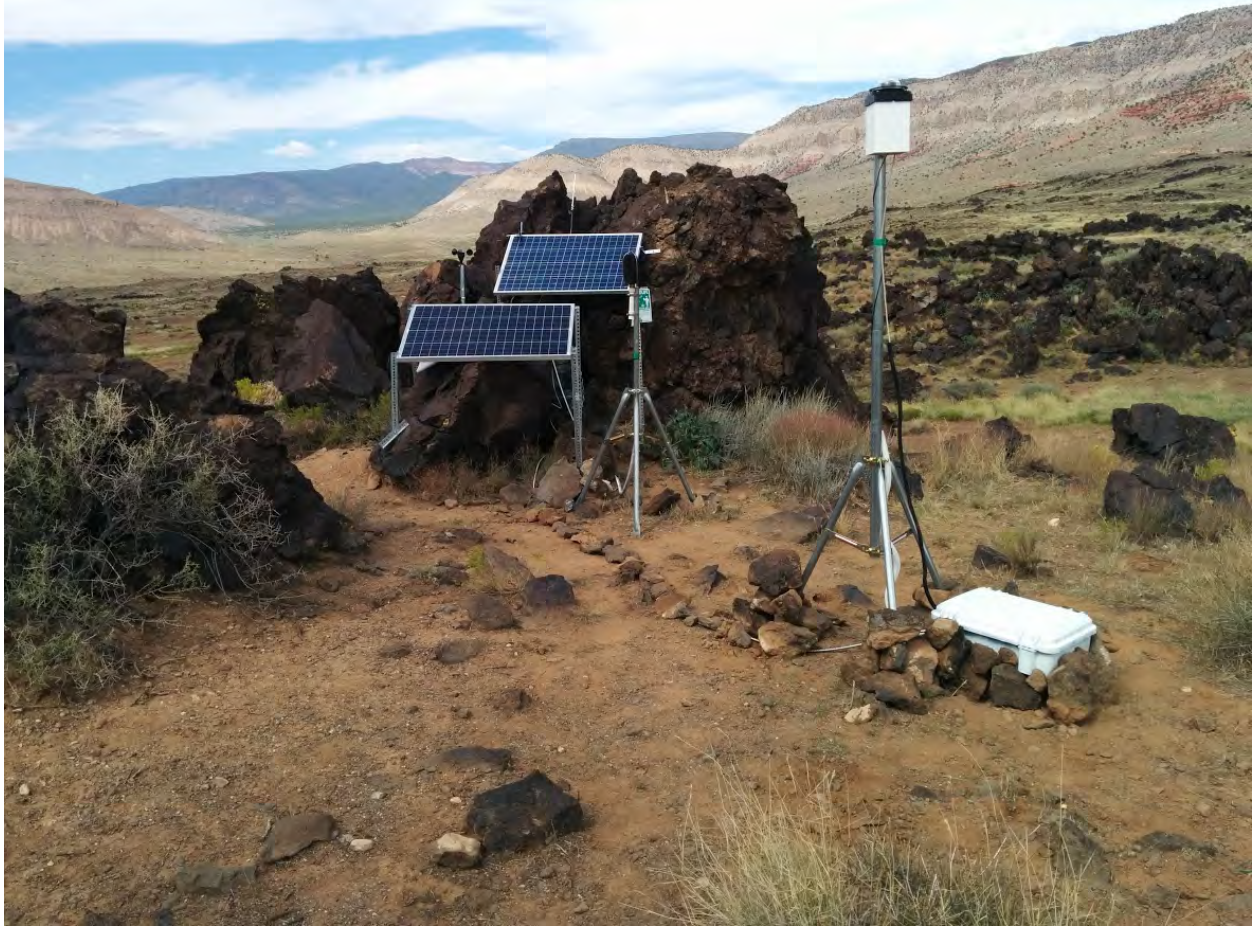
Figure 5. All Sky Camera mounted on tripod in the foreground, with soundscape equipment mounted on the tripod near the solar panels.