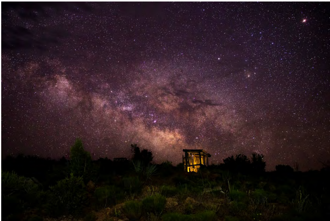
Figure 2. Grand Gultch mine out-building located in Grand Canyon-Parashant National Monument.

Efforts are underway to support a Dark Sky Sanctuary at Grand Staircase-Escalante National Monument, located 58 miles northeast of PARA. Staff has provided consultation on three meetings along with providing templates and content for their nomination package. Their current status is awaiting approval from their Monument Manager, and State Director. With Parashant staff assistance, nomination submission is expected February 2017.