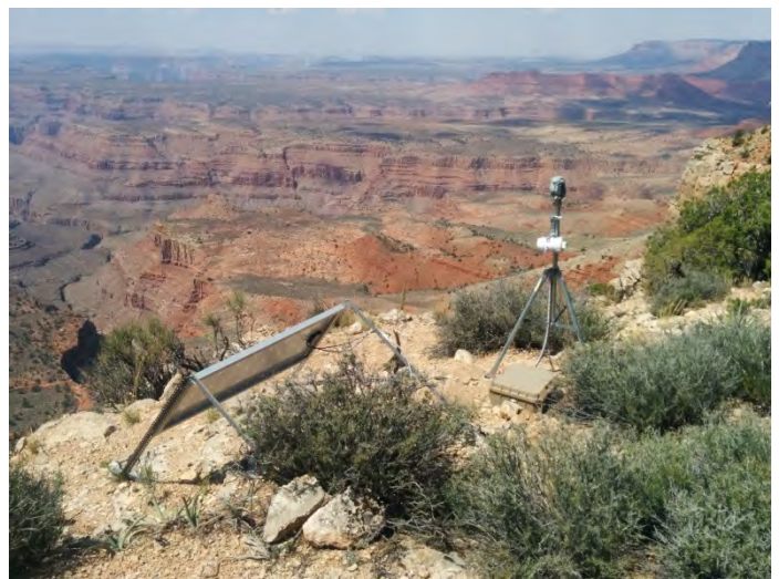
Figure 3 & 4. Twin Point Dark Sky Station located along the northern rim of the Grand Canyon-Parashant National Monument.

In addition to Unihedron SQM metrics, an All Sky Camera (SBIG Allsky-340C) was installed in a remote location powered by solar, and is currently providing a 360, horizon-to-horizon monitoring of light levels, allowing for management of identify sources of sky glow. Settings have been set at max 60 second exposure, with one minute intervals, allowing for dramatic timelapses -helpful for interpretation as well. Considering the success of this camera setup, next year Parashant DSP anticipates adding a mobile, higher resolution camera, which will be deployed for short durations (3-4 weeks) at various locations allowing for a greater scope of monitoring.