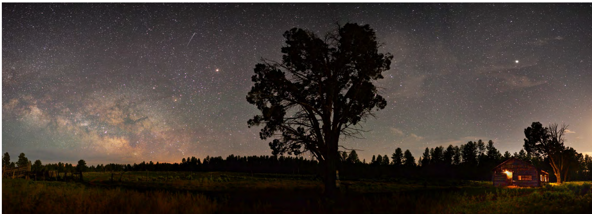
Figure 7. New 2016 brochure front cover image, Waring Ranch historical building with night skies, Grand Canyon-Parashant National Monument.