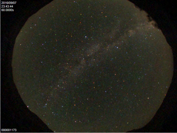
Figure 6. Captured images from All Sky Camera on September 7 th , 2016.