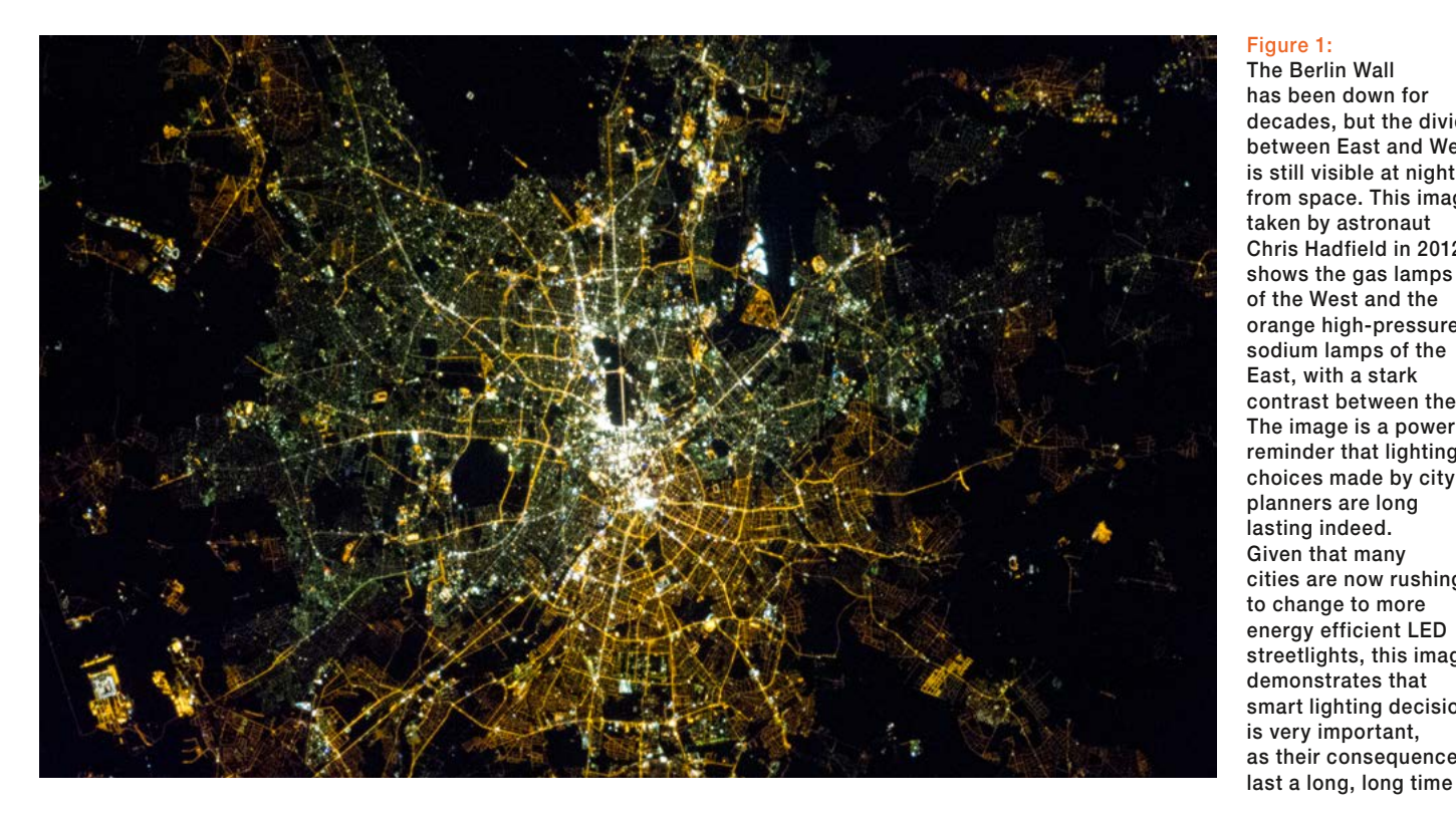
Figure 1: The Berlin Wall has been down for decades, but the divide between East and West is still visible at night from space. This image, taken by astronaut Chris Hadfield in 2012, shows the gas lamps of the West and the orange high-pressure sodium lamps of the East, with a stark contrast between them. The image is a powerful reminder that lighting choices made by city planners are long lasting indeed. Given that many cities are now rushing to change to more energy efficient LED streetlights, this image demonstrates that smart lighting decisions is very important, as their consequences

component. This is significant because delayed spawning can negatively affect the reproduction of an already threatened species.