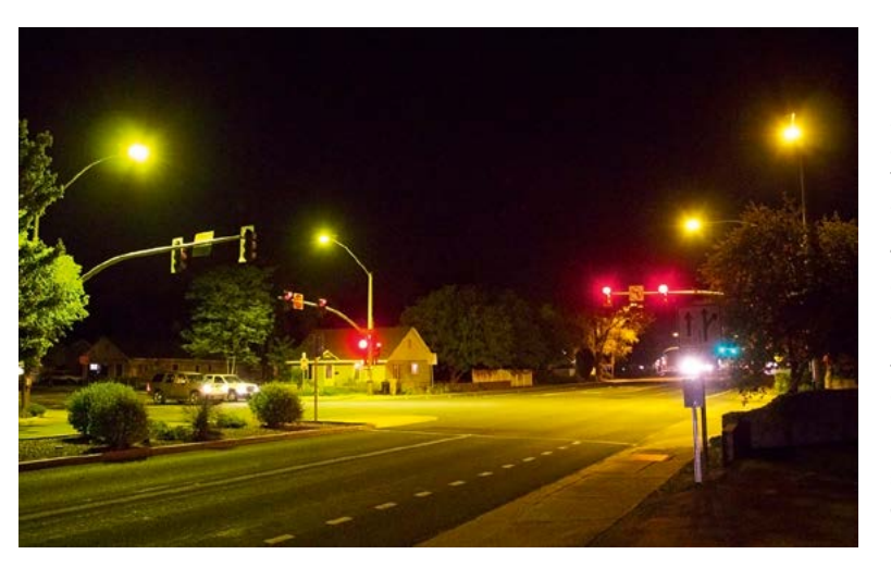
Figure 3: Filtered LED (left) and phosphor-converted amber LED (right) are shown here in a test installation at an intersection in Flagstaff, Arizona. The City of Flagstaff is currently testing these and other low-bluelight LED technologies for the replacement of its existing lowpressure sodium municipal lighting system

White LED lighting need not emit large amounts of blue light in order to accurately render colors in outdoor spaces at night. Low-CCT white LED systems now achieve color rendering index values comparable to those of higher-CCT lights, further lowering barriers to their adoption. This quality addresses concerns frequently addressed by law enforcement agencies about the color of lighting and its perceived effect on public safety.