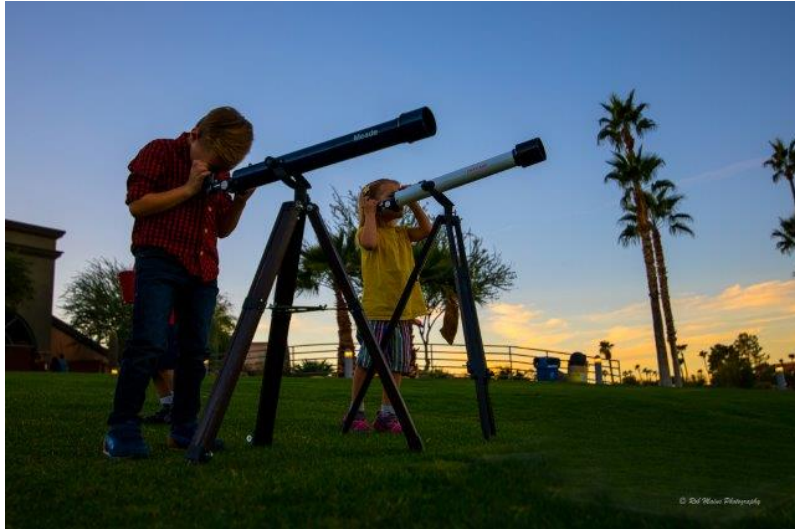
Young star gazers in Fountain Hills.

Looking even further into the future, plans are underway to potentially bring a privately funded public observatory to Fountain Hills. That's when some serious stargazing will excite kids and adults alike, spark imaginations, teach science, and inspire thoughts about our place in the cosmos.