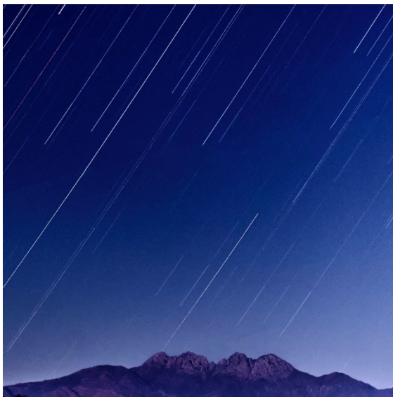
Time lapse night photo taken from Fountain Hills of Four Peaks Mountain.