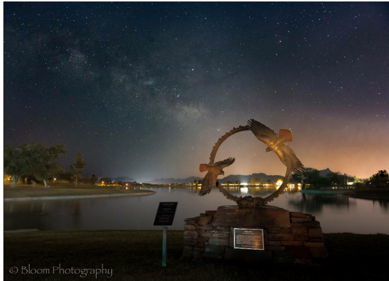
Milky Way Galaxy over Fountain Lake. Infinity Ring by Charles Sherman.

Because of the effort of the FHDSA and the support of the town council and town staff, the outdoor lighting and sign ordinances were updated to address new causes of light pollution.