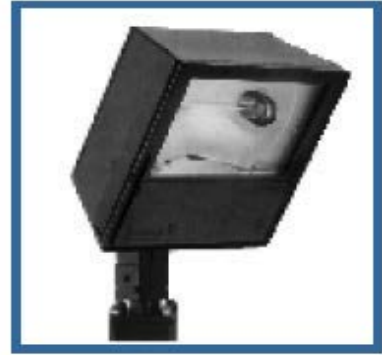
Floodlights or lights not aimed downward